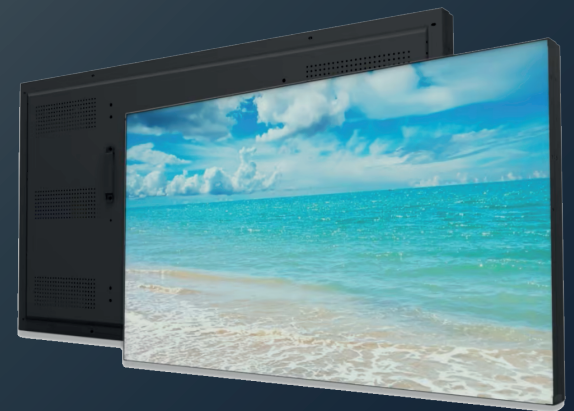
Collaboration & AV