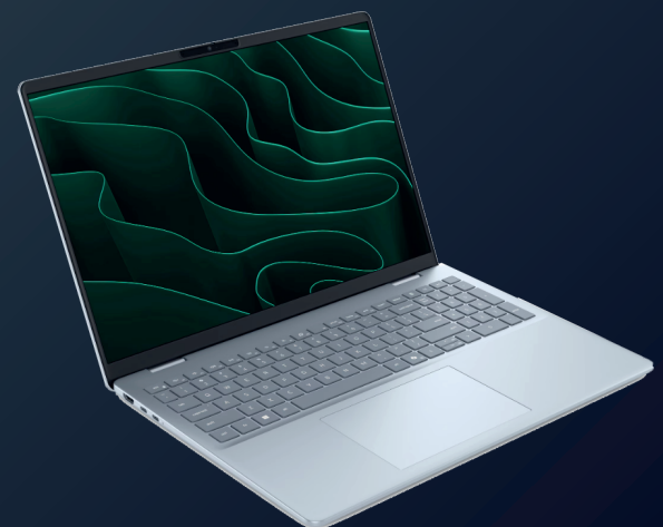
Computing & Mobility