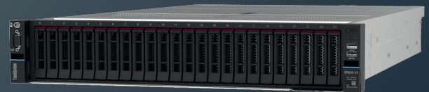
Storage & Security