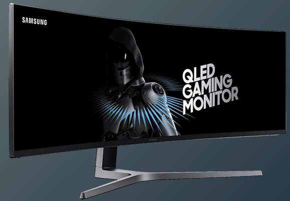
Display & Peripherals